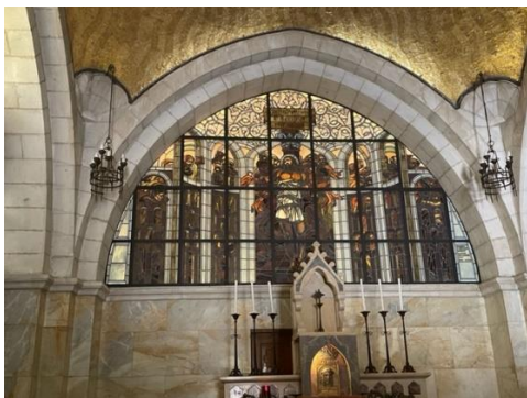
The church of the Flagellation, one of the stations of the cross on the Via Dolorosa in Jerusalem