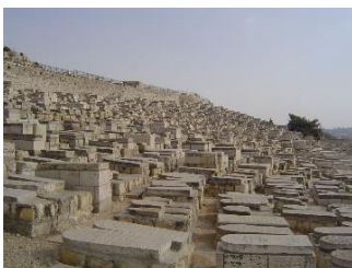
Jewish graves on the Mount of Olives