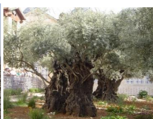
Ancient Olive tree, Garden of Gethsemane