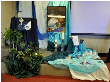
Setting the stage for Convocation