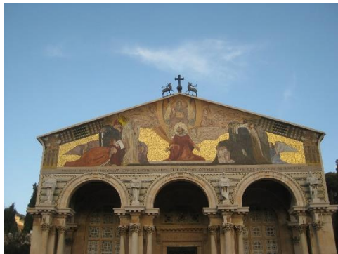
The church of All Nations, Mount of Olives, just below the Garden of Gethsemane