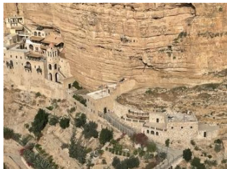
The road from Jerusalem to Jericho: St George's Monastery in Wadi Qelt.