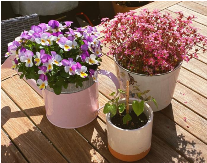
Lou's Morning Glory seedling plus friends