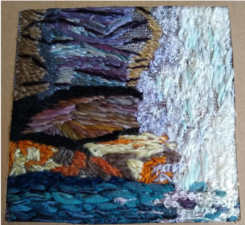
'Rocks strata and a Waterfall' created by Sue de Gruchy using only one type of stitch – Roumanian couching