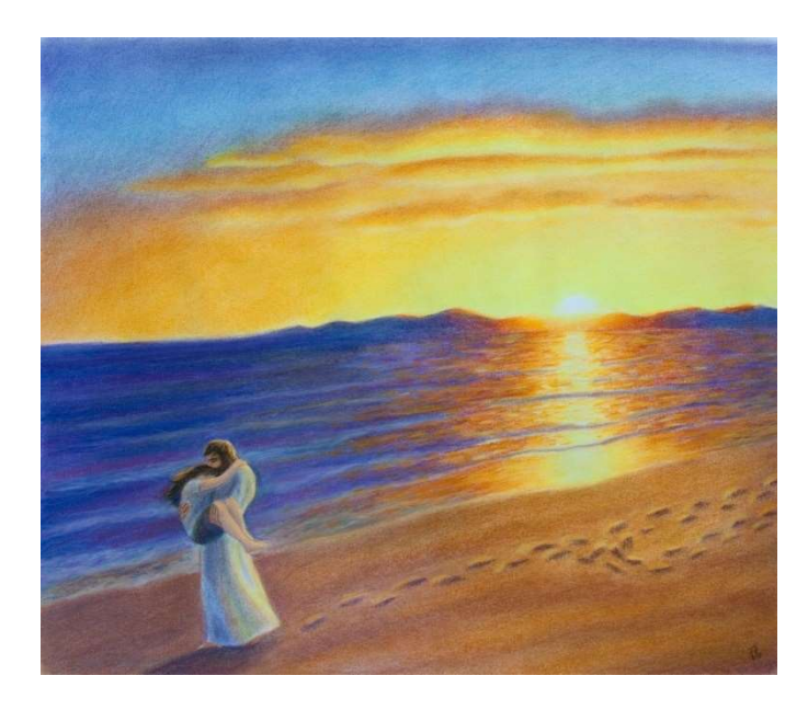
Footprints in the Sand

Hymn: The Lord's my Shepherd: Townend (StF 481) Sing/ Read /pray /proclaim the words or listen to it here https://www.youtube.com/watch?v=pN4tPkX0MG0